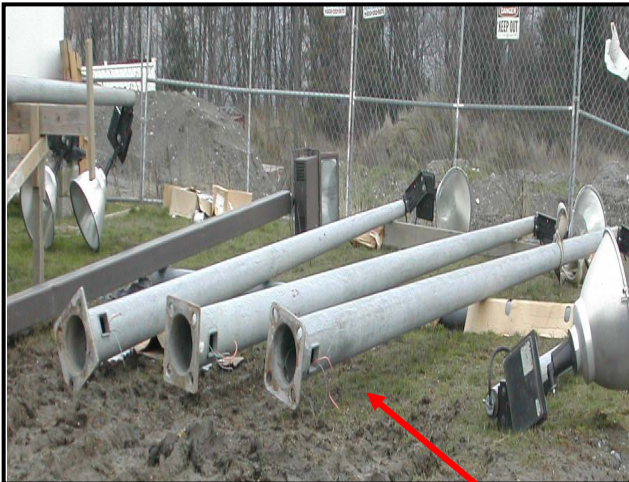
Poles are located on the ground

Placing the work between the knees and shoulders minimized the need for workers to be on their hands and knees and/or bending their backs. The ideal location is usually at or above waist level.